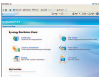
The Synology setup screen