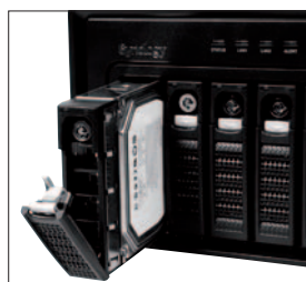
Individual flip open bays for the hard drives