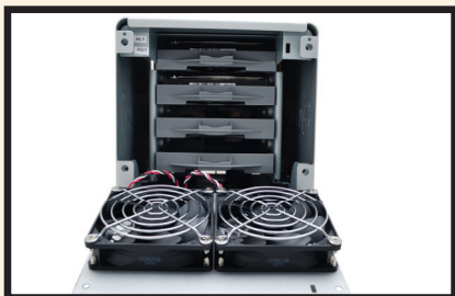
Hard drive management is easy, thanks to easily removable trays