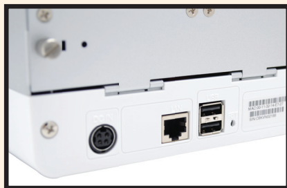
The DS413J can support up to two USB drives as external expansions